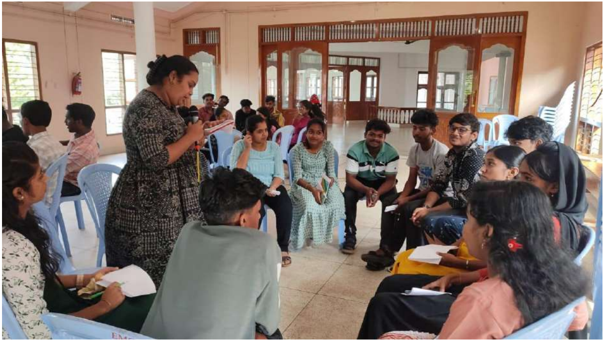
Debate on Gender Equity