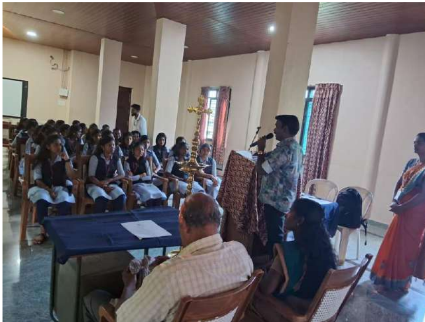
Awareness programme on Save the Girl child

The institute organizes several training programmes, seminars, workshops etc. on gender equality and sensitization and also celebrated women's day. Ensuring the integration of gender dimension in social activities in the campus. Conducting activities by Women's cell to encourage girl students to improve their competitive spirit in approaching life. In view of admitting more number of girl students transportation facility to be introduced. Women's cell to be reconstituted and strengthened to take care of the welfare of the female and the faculty members. Counselling for students by a psychologist will be arranged. Yoga for students with the view of helping them to maintain their physical and mental health to be introduced. Providing exposure to the students to foreign avenues by introducing study abroad programmes. With an aim of increasing the confidence, communication skills will be boosted for the students through the training. Provide specific courses dedicated to gender issues. Conducted an awareness programme on Save the Girl child.