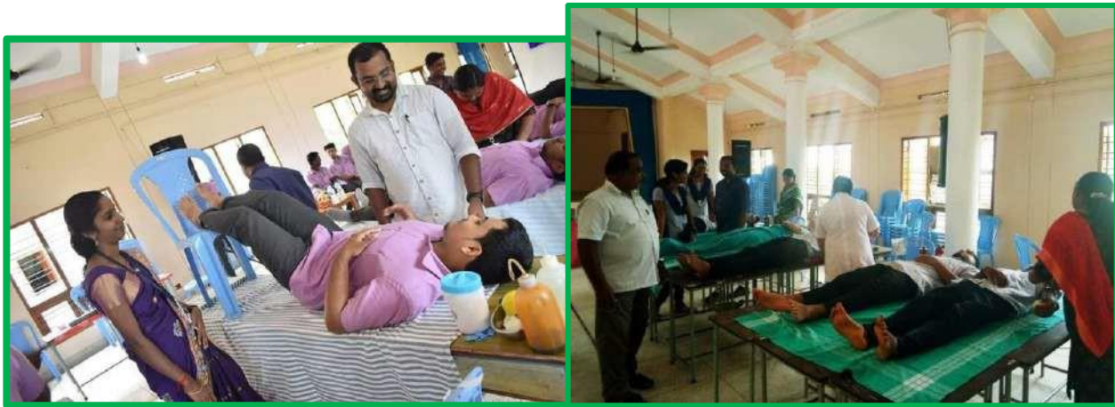
Blood Donation camps