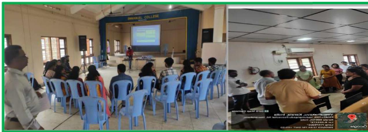
Placement cell orientation classes