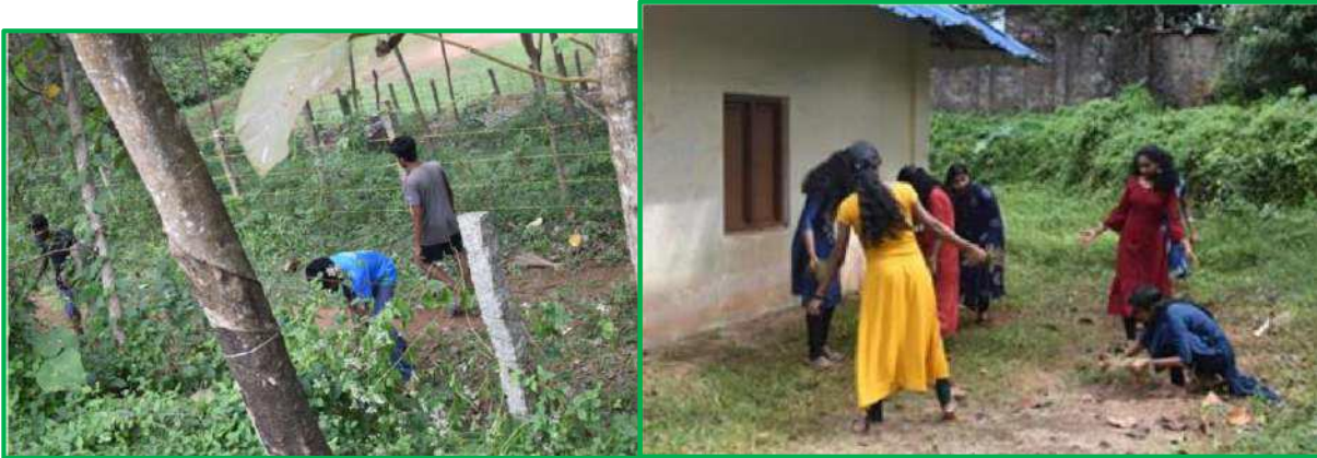
Cleaning activities in puravimala adopted village