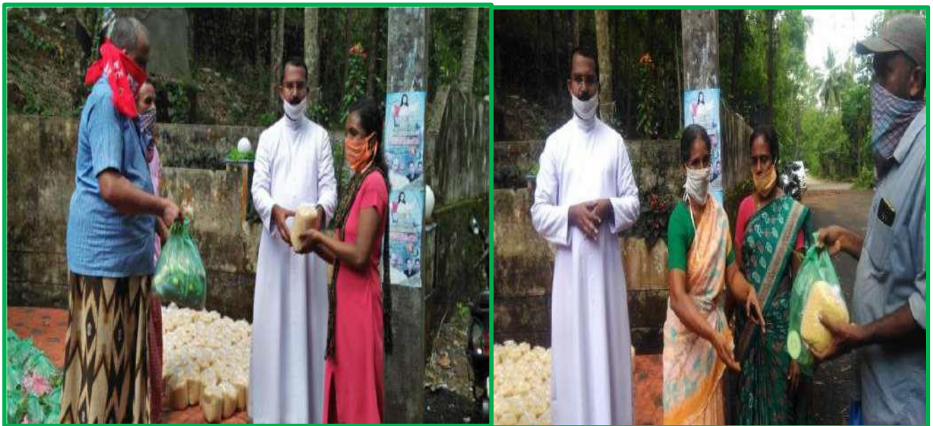
Food materials distribution in puravimala ,Adopted village