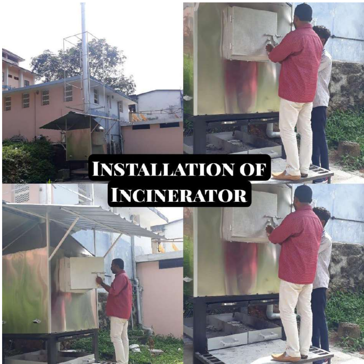
Incinerator installed in college campus to destroy wastes