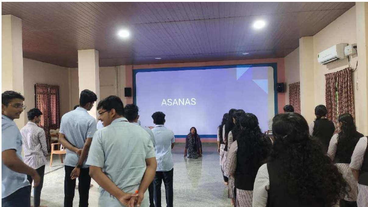
Students practise different Asanas of Yoga