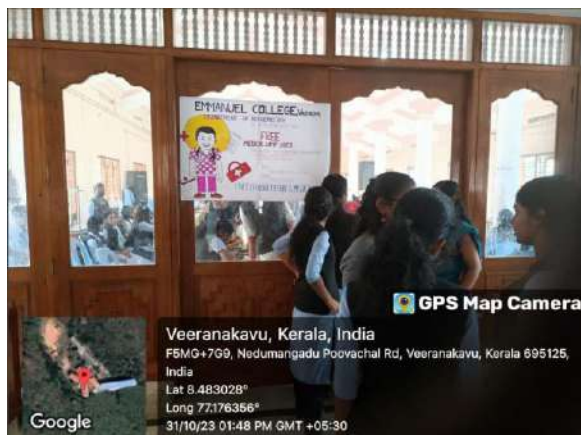
Students waiting for consultation