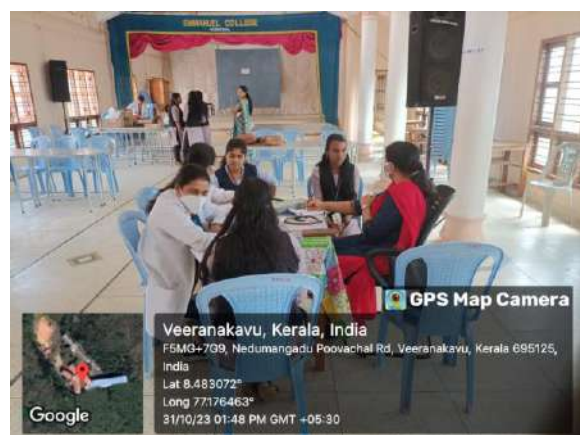
Students consulting with the doctor