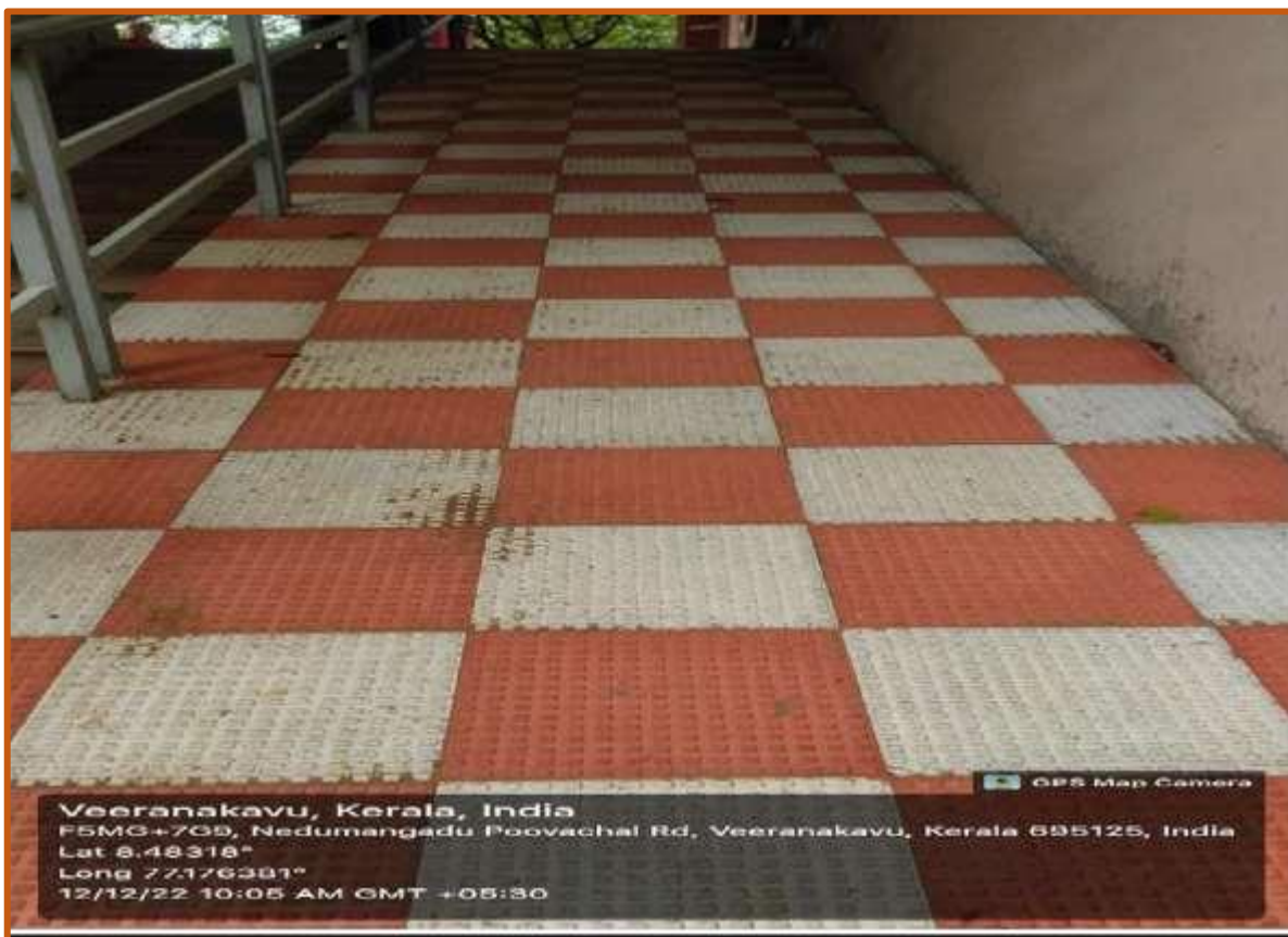
Disabled-Friendly Path Way